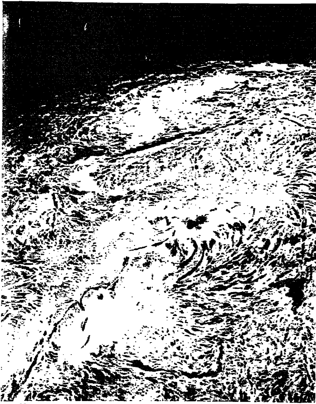
Possible long drought in U.S. West is forecast from the sun -- This is a telescopic view of the sun as seen in light given off by hydrogen.

BOSTON, (CSM). — After a hard winter, the United States west of the Mississippi River should be alert to another potential climatic hazard -- severe drought -- meteorologists warn.